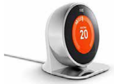
336357 Charging Stand for wireless Nest installation

All Nest thermostats are supplied with Heat Link, which acts as a wireless receiver and power supply to the Nest thermostat if required.