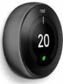
101497B Nest Learning Thermostat - Black