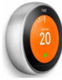
101497SS Nest Learning Thermostat - Stainless Steel